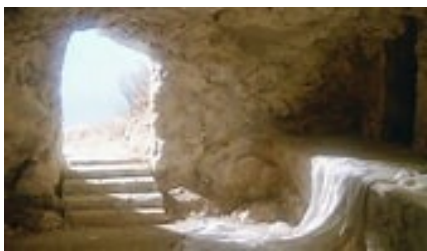
THE EMPTY TOMB

Sunday, May 30: $100 Catastrophic Fund; St Tikhon’s Seminary $15; $50 Baby bottles; $100 Cemetery Fund