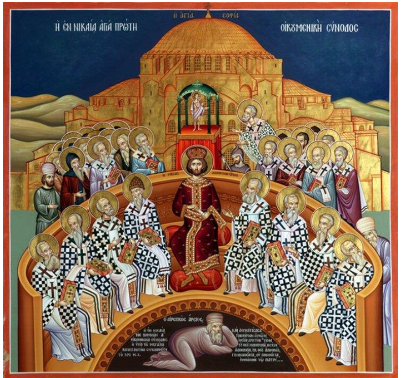
1 st Ecumenical Council – Nicaea 325