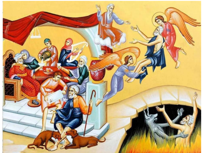
The rich man and Lazarus

Brethren: You are the temple of the living God. As God has said: "I will dwell in them and walk among them. I will be their God, and they shall be My people." Therefore "Come out from among them and be separate, says the Lord. Do not touch what is unclean, and I will receive you." "I will be a Father to you, and you shall be My sons and daughters, says the LORD Almighty." Therefore, having these promises, beloved, let us cleanse ourselves from all filthiness of the flesh and spirit, perfecting holiness in the fear of God.