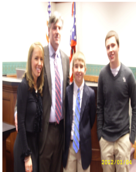
a family complete